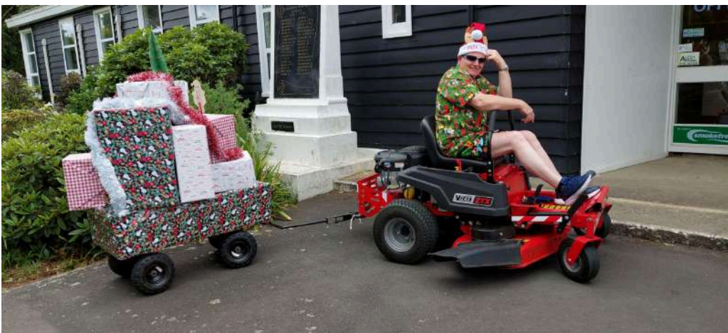
Santa's Elf made a visit to BGP in the last week of term 4.

As we start the year, we need to be mindful of the weather. Currently we are being subjected to very changeable weather. This means that we need to prepare children appropriately. Please make sure they have sunscreen on and a drink bottle in their bag that can be topped up to help keep them hydrated. Equally it may be that a jacket / raincoat is needed. Please make sure you name all uniform items. Named items make their way back to their owners.