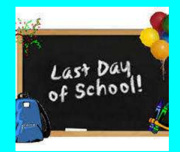
Last day of term Friday 5 July