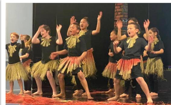
The amazing tamariki of Te Rakiātea performing at our Te Wiki o Te Reo Māori celebrations yesterday morning.